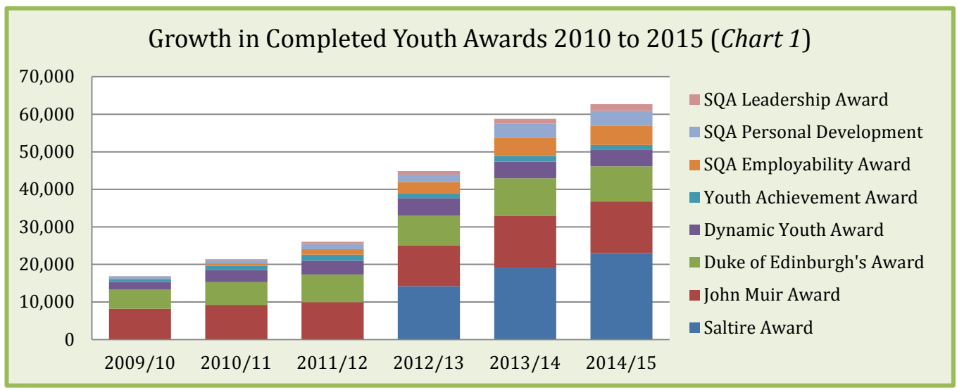
Note: This graph does not include the full range of youth awards delivered by the Awards Network and uses slightly different reporting years.