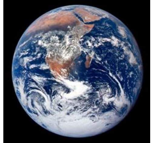
Image courtesy NASA Johnson Space Center Gateway to Astronaut Photography of Earth. Available for use under Creative Commons Attribution-NonCommercial 2.0 conditions.

The consumption of scarce resources is in itself contributing to global warming. Oil, gas, coal and even uranium will eventually run out. The first two may already have reached their maximum production levels with no new large fields to be found. We need to reduce our consumption of the Earth's resources to a sustainable level, end our reliance on fossil fuels,