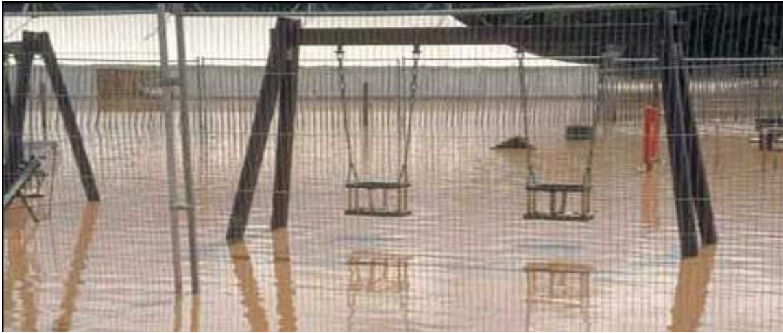
Photo credit: Scottish Environment Protection Agency. Images are freely available for educational use in Scotland.

The Earth's climate is changing. The world is growing hotter. The average global temperature has increased more rapidly in the last 50 years than at any time in the whole of recorded history. The biosphere, where all life on Earth exists, is under threat.