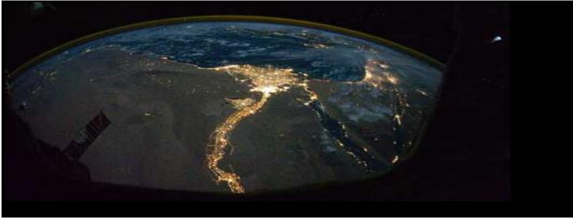
Cairo and Alexandria, Egypt at Night

A Yale public opinion survey 1 in 2010 showed that only 34% of respondents believed that scientists agree about climate change. This is at odds with research which shows that there is a significant agreement among scientists about climate change.