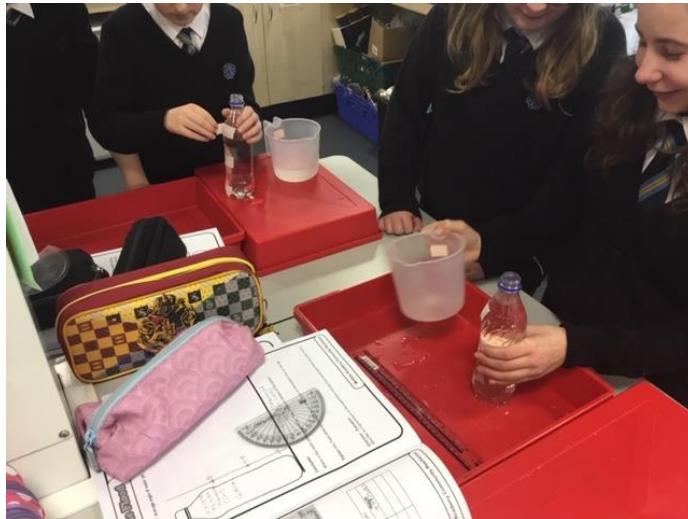
Learning about Flood Defences in S1.