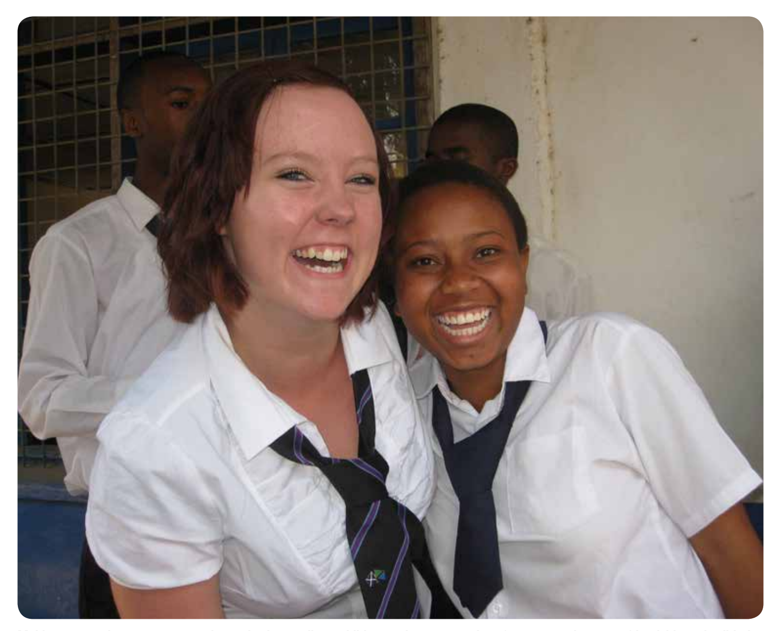
Making connections across countries and cultures allows children and young people to foster mutual respect, friendship and solidarity.

A group of learners took part in a 2014 Commonwealth Games challenge. They researched and analysed the United Nations Millennium Development Goals (MDGs), which they reworked and performed as a rap. The MDGs provided an opportunity to make connections between extreme poverty around the world and how individual actions can make a difference. By studying the values and aspirations that unite many countries, learners came to appreciate the need for mutual respect and solidarity. Making contact with children in other countries increased their empathy and helped develop their communication skills. It also motivated them to raise awareness and take action in their local community.