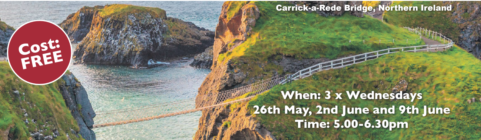
Carrick-a-Rede Bridge, Northern Ireland