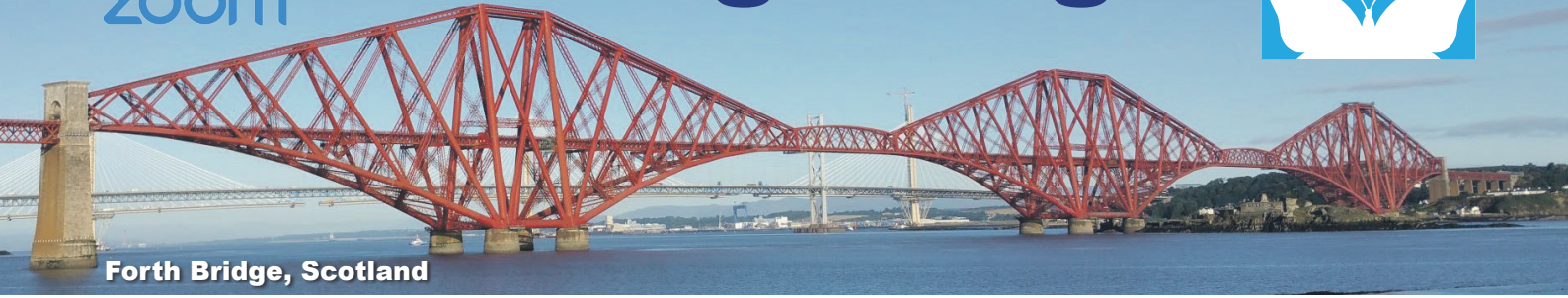
Forth Bridge, Scotland