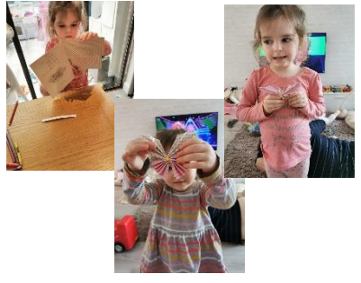
Nursery children creating and designing their own butterflies.