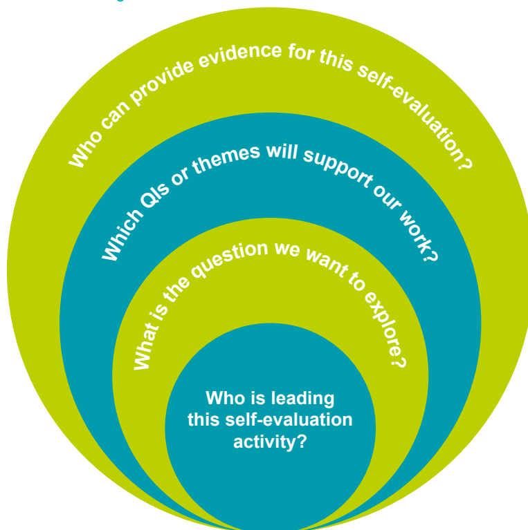
Fig. 5: Self-evaluation – taking a closer look

To support your self-evaluation strategy, individuals and teams of staff and partners across the school community will find the toolkit helps them to analyse the impact of their work on learners. Quality indicators or themes from different quality indicators can be bundled together to enable a focus on a particular area of work such as family learning, employability skills or ensuring equity. Developing more specific self-evaluation questions and identifying relevant partners can create a focused context for this type of self-evaluation. This approach can help you identify aspects of school life which need a greater focus through individual professional development or collegiate working. Similarly, partners can develop their own bespoke self-evaluation toolkit by bringing together quality indicators or themes from different self-evaluation frameworks.