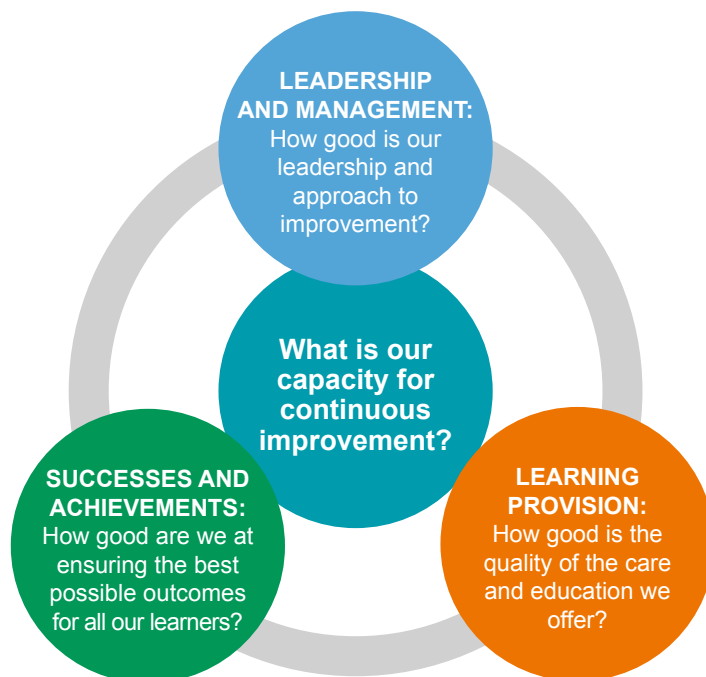
Fig. 6: How good are we now? How good can we be?

This diagram illustrates the strong relationship between each of the aspects and the central question about the school's capacity for improvement. A range of appropriate evidence of all three aspects is required to evaluate the school's overall performance. It is however possible to use a only a few of the quality indicators or even a cluster of themes across quality indicators to support self-evaluation related to very specific aspects of a school's life and work.