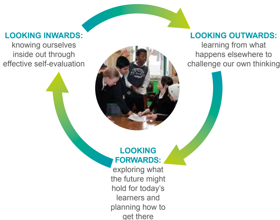
Fig. 2: Inwards, outwards, forwards

Through this approach, you will look inwards to analyse your work, look outwards to find out more about what is working well for others locally and nationally and look forwards to gauge what continuous improvement might look like in the longer term. How good is our school? is intended to support you and your partners in looking inwards to evaluate performance at every level and in using the information gathered to decide on what needs to be done to improve.